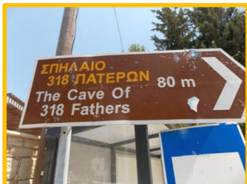
Sign to the cave

Information taken from www.archimandrita.org