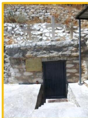
Entrance to the cave