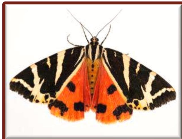
When wings are open