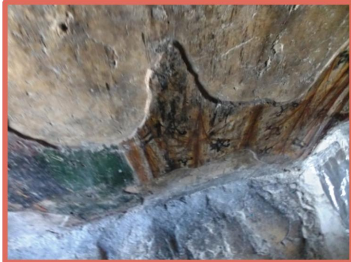
Frescoes inside the cave